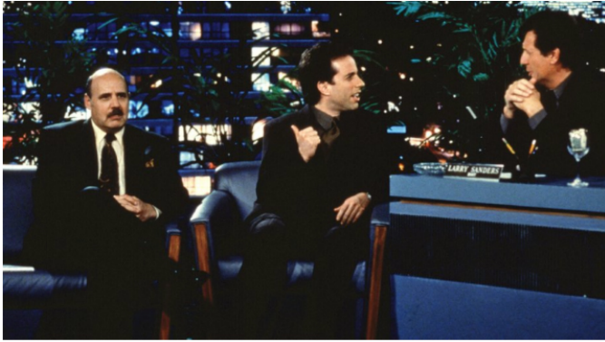
From left: Tambor, Jerry Seinfeld and Shandling on a 1998 episode of 'The Larry Sanders Show.'

Shandling certainly was an excellent judge of talent.